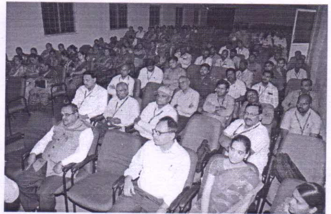
Audience: Faculties of KAHE