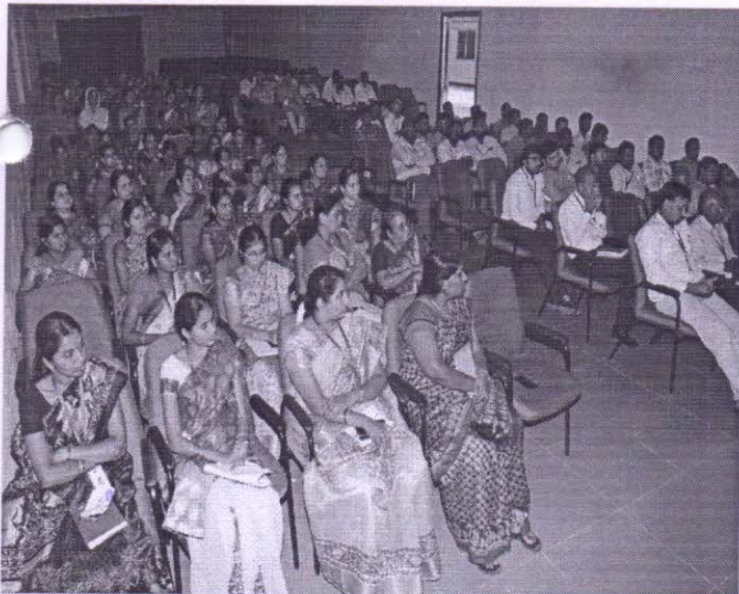
Audience: Faculties of KAHE