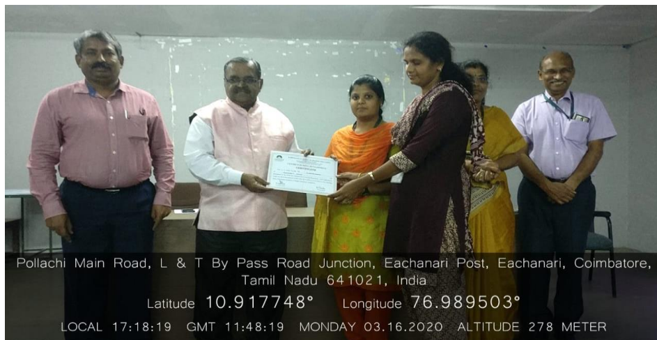
Distribution of Certificate by Vice Chancellor to the Participants