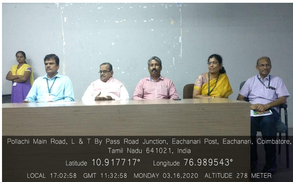
Inaugural Session of Administrative Training Programme” for Non-teaching Staffs

The following are some of the few important topics covered in the training programme: General: Vision, Mission, Core Values, Motto – Quality Policy, Statutory Bodies: Board of Management – Academic Council – Planning and Monitoring Board – Finance Committee – Board of Studies. Ministry of Human Resource Development, Central Funding Agencies, Integrated Library Management System (ILMS): e-journals – e-books – e-shodhsindu – shodhganga – Database. Ranking Agencies, Documentation and Instrument Calibration, Basic Solution and Culture Preparation, AMC, Maintenance of Register, Storage of Chemical and Register and Good Lab Practices. Examination Management System (EMS) - e-governance in Administration – Finance and Accounts – Students Admission and support – Examination – NAD. Functions of Establishment Section – Examination Section – Finance Section – Research Section – Records / Registers to be maintained. The validation held in the afternoon of 16.03.2020 with feedback by the participants and Certificate Distribution.