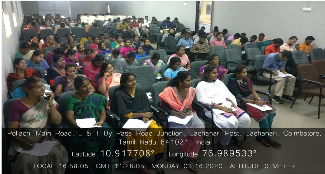
Participants Attending Session