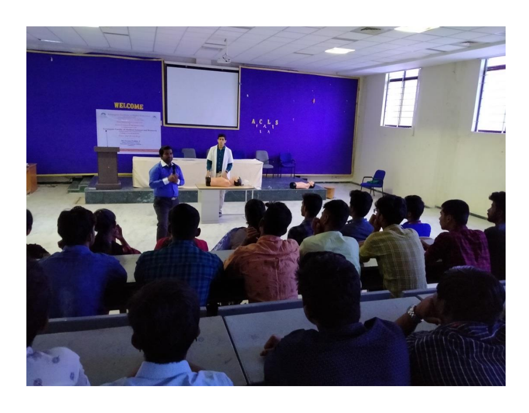
Lecture on First Aid in students