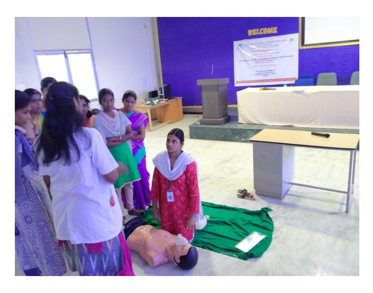
Non-teaching faculty members experimental hands on training