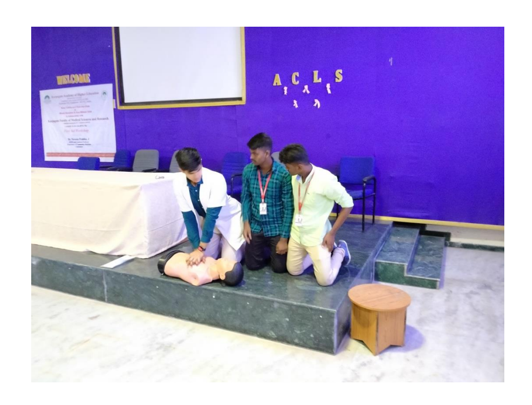
Students members experimental hands on training