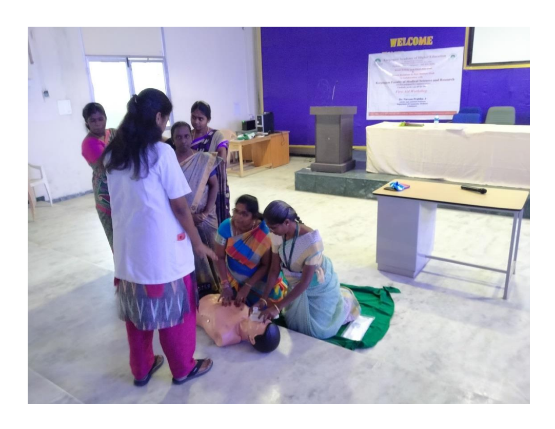
Non-teaching faculty members experimental hands on training