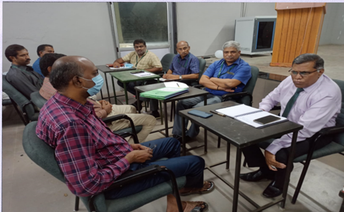
The Resource Persons interacting with the Participants (12.11.2022)

(Staff) (Participants) (Resource Persons)