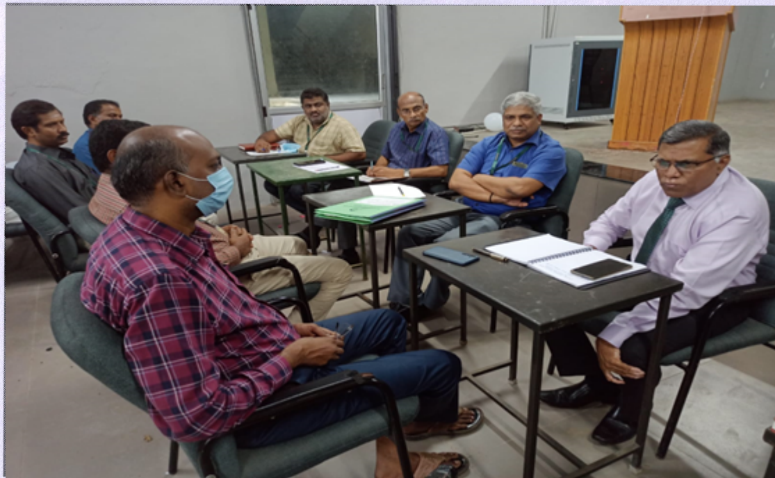
The Resource Persons interacting with the Participants (12.11.2022)

(Staff) (Participants) (Resource Persons)