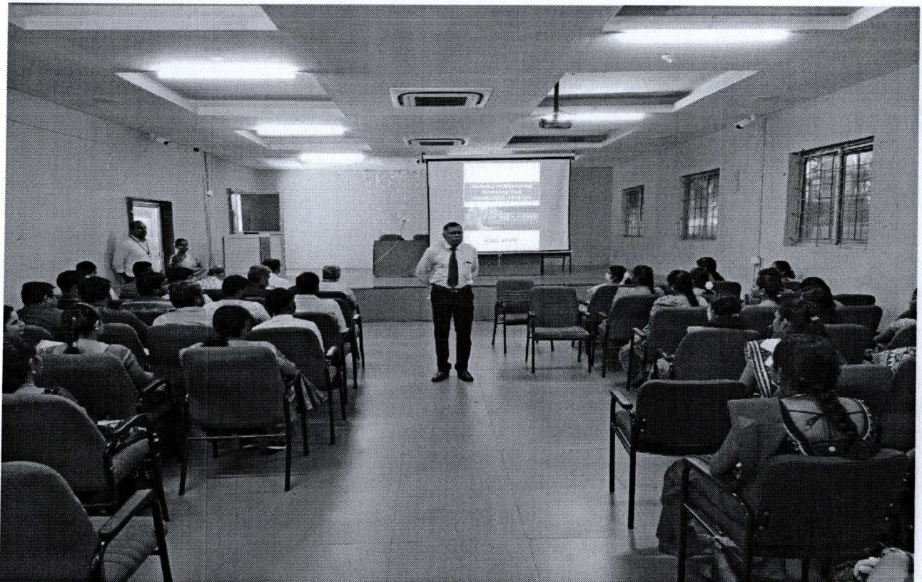
Opening Remarks by the Vice Chancellor (13-08-2022)