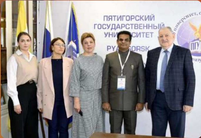
An international conference on Architecture and Design was hosted by the Higher School of Design and Architecture, Pyatigorsk State University, Russia. An MoU for student exchange, summer school, and research were signed by our institution.