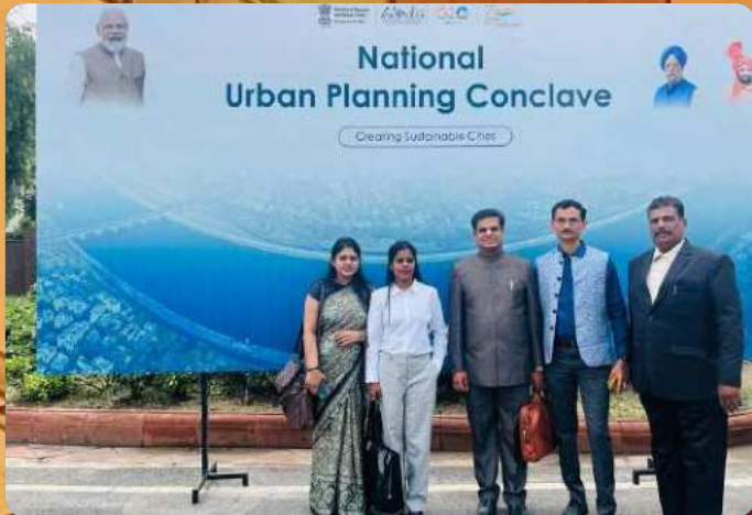
We are proud to be in the Top 50 academic institutions and one amongst the three institutions from Tamil Nadu to present at the National Urban Conclave at Delhi in July 2023.