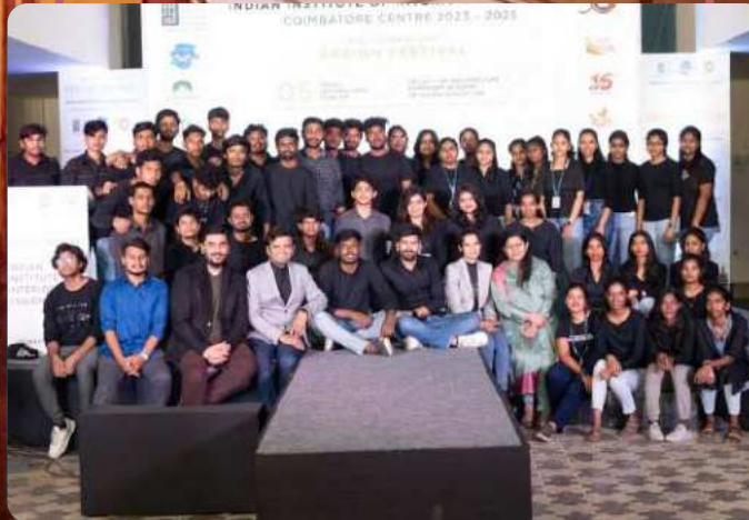
The IID Coimbatore's Design Festival was hosted at FADP on 05 January 2024 in tie with the Institute of Indian Interior Designers (IID), Coimbatore chapter. The event included speakers across a national platform, workshops and seminars on a global level.