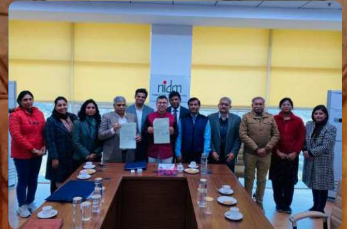
We have signed an MoU with "National Institute of Disaster Management" (NIDM) for research collaborations.