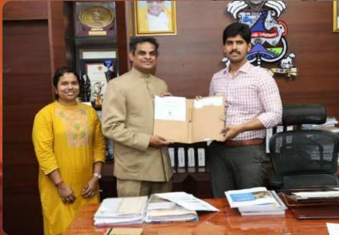
An MoU with smart city, Coimbatore chapter was signed on 05 July 2023 under the scheme "Smart Cities and Academia Towards Action & Research"(SAAR). We are officially a part of the review panel for the smart city, Coimbatore.