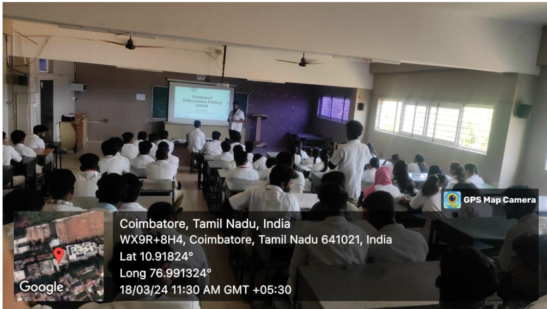
NEP Saarthi's presenting the session