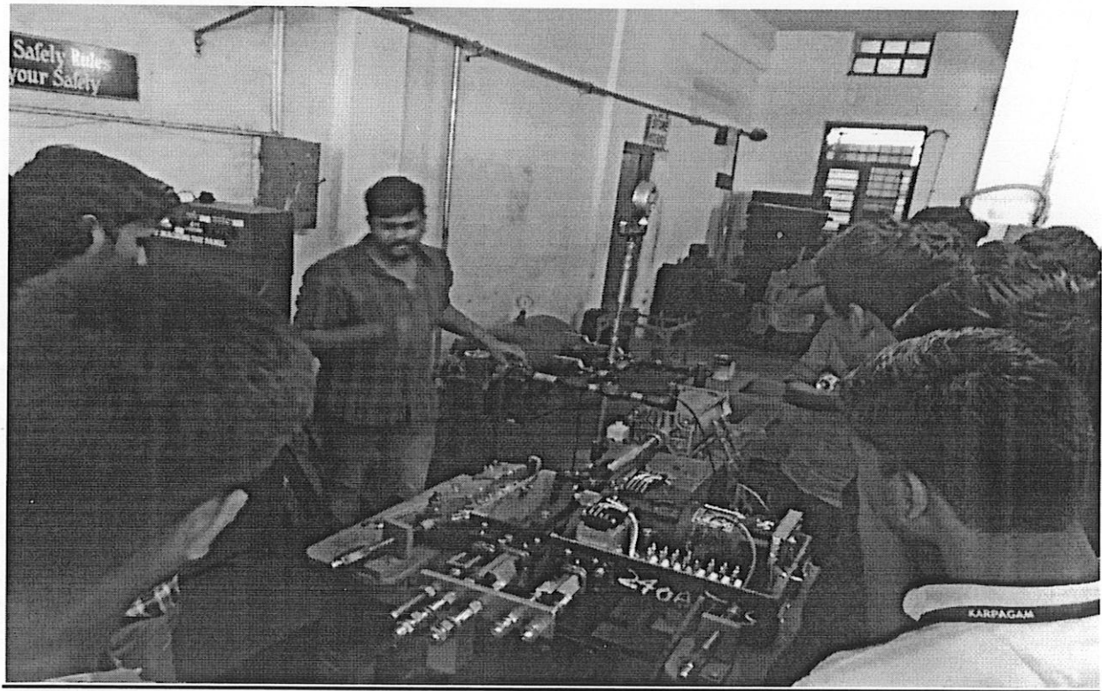
S&T Engineer describes the assembly sequence of Point Machine