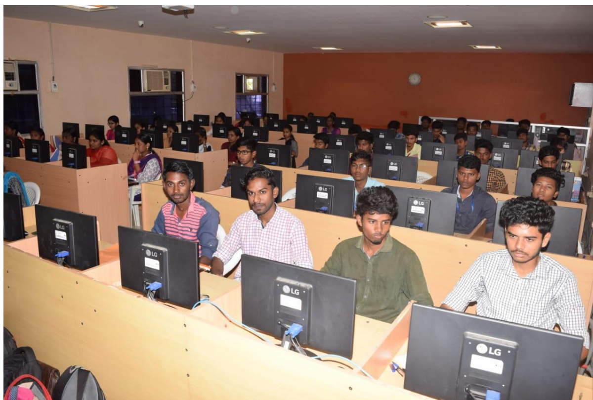
WORKSHOP ON EXCEL FUNCTIONS ON 08.09.2017