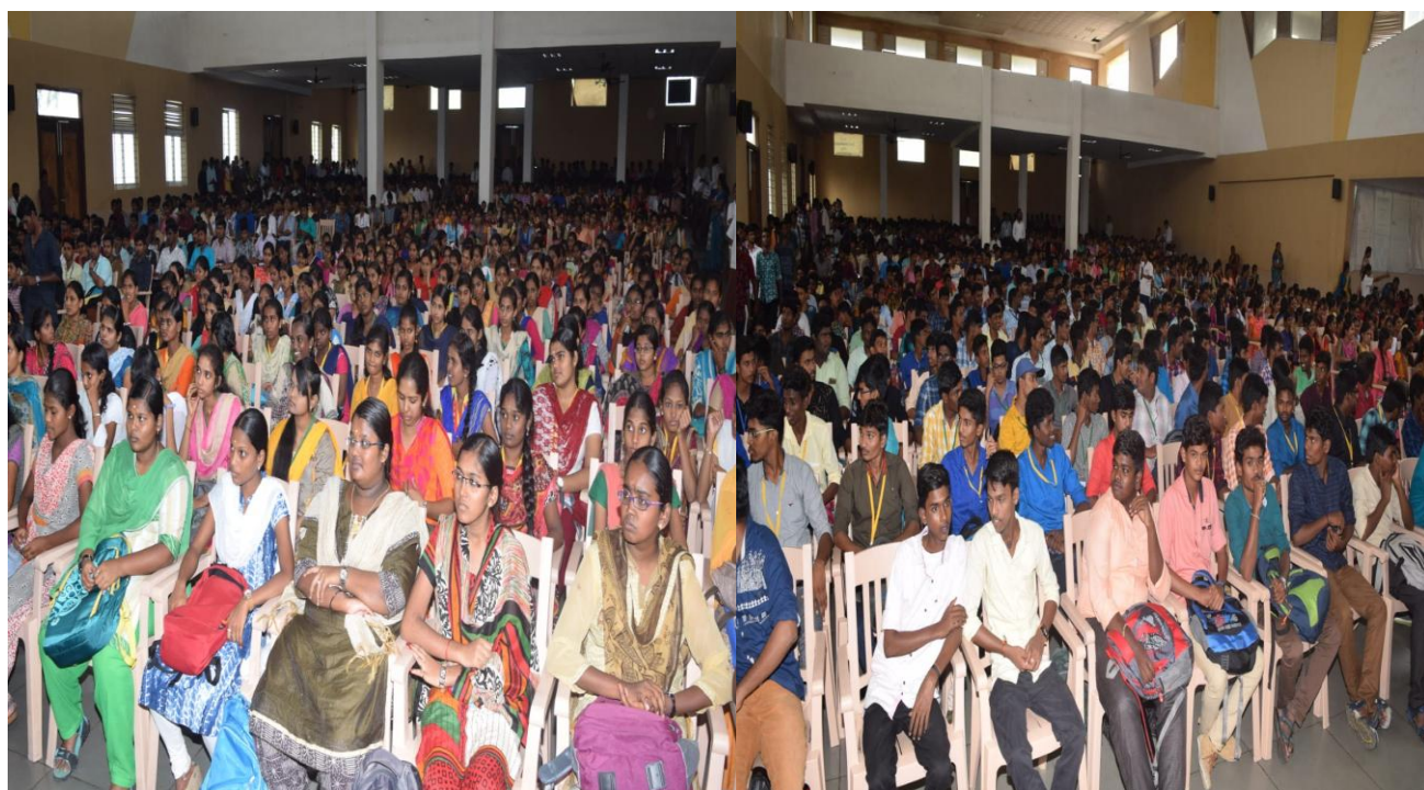
WORKSHOP ON CREATIVE AND BUSINESS COMMUNICATION SKILLS on 01.02.2018