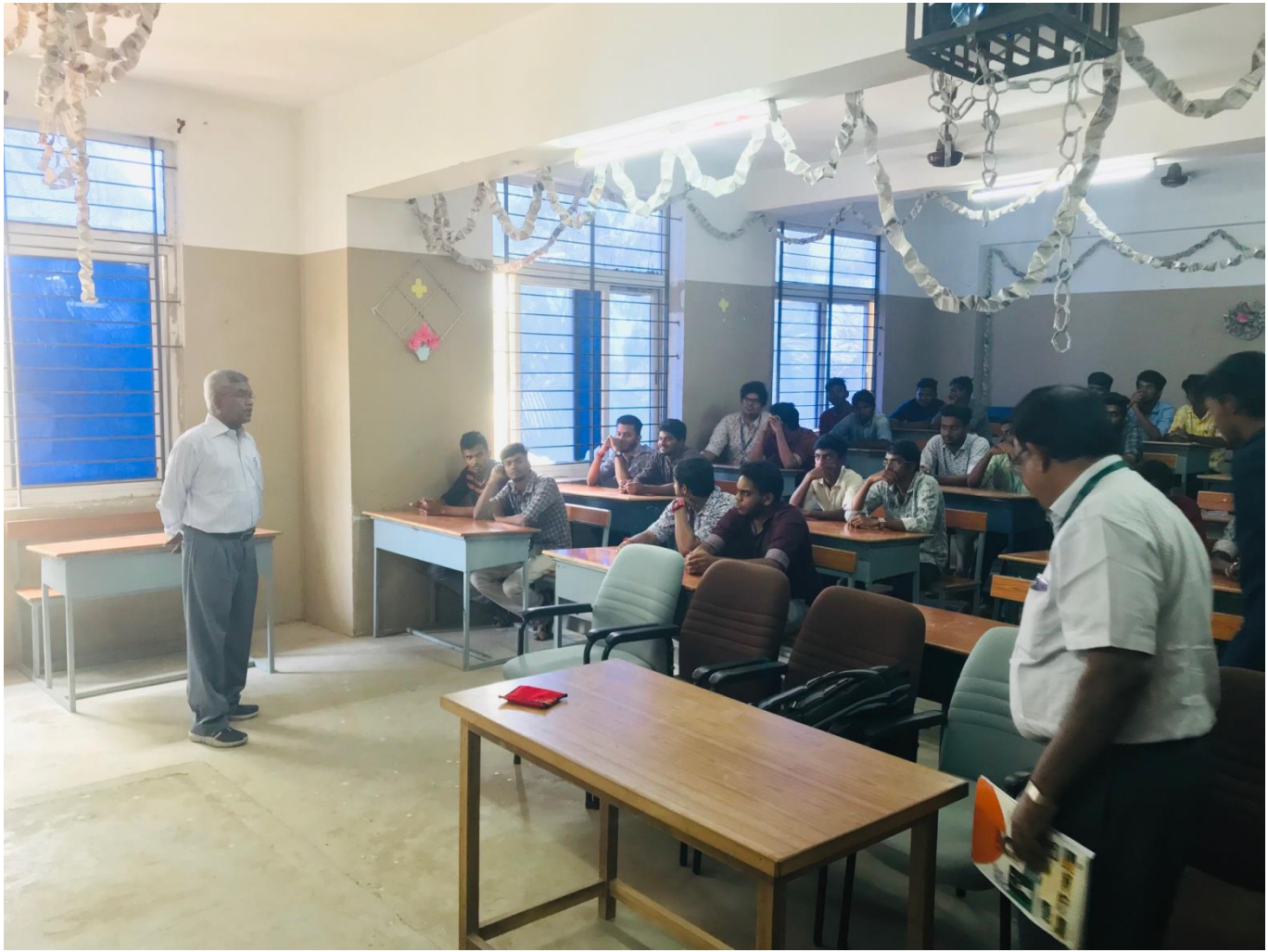
Delivered the addressed to the students