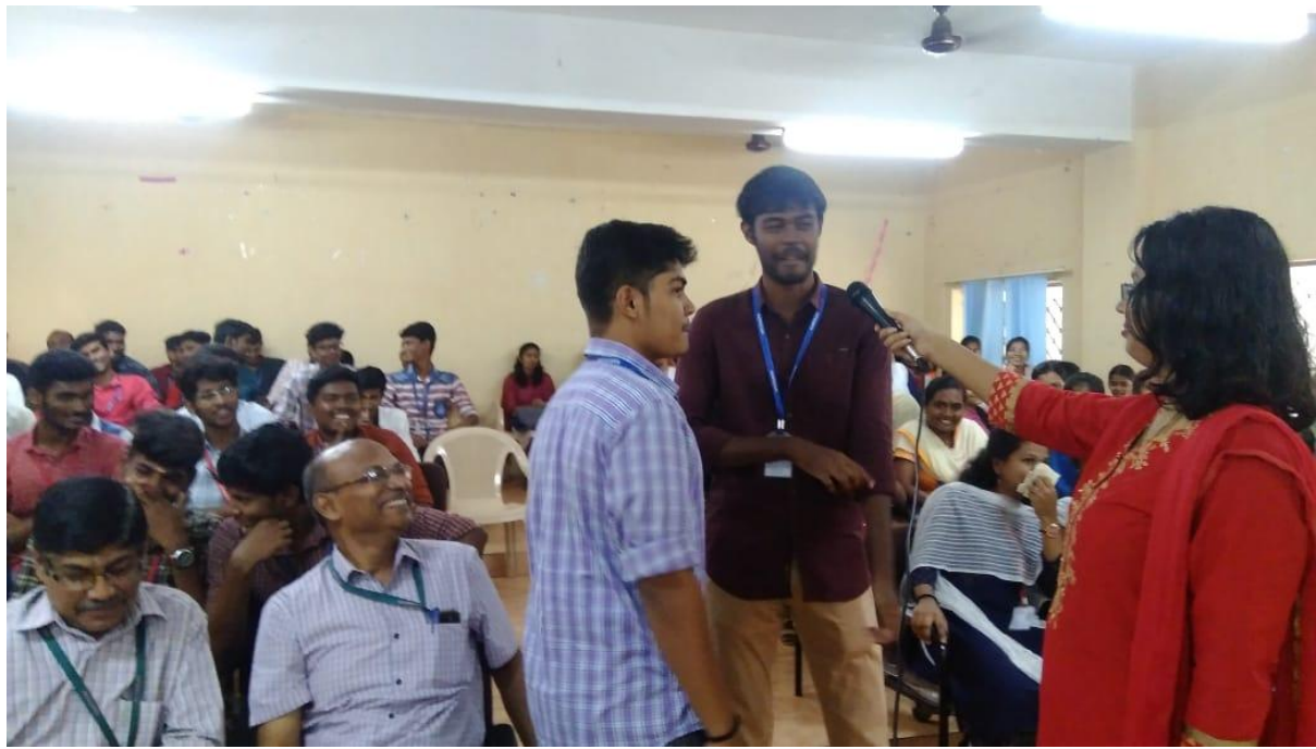
Interaction with students in the workshop