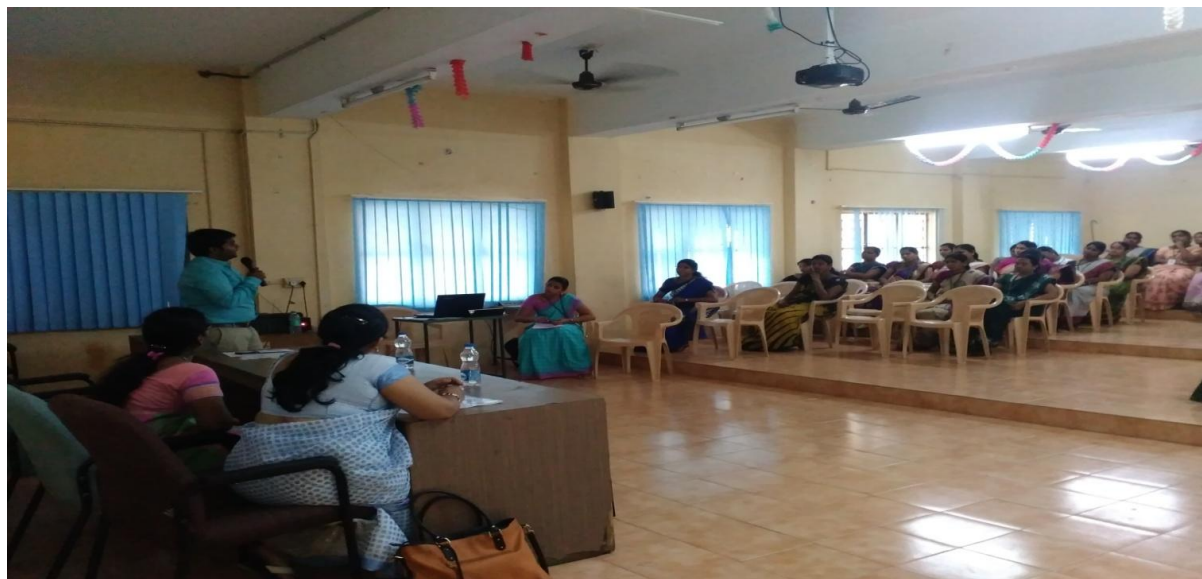
Chief Guest interaction with the participants

The guests of the workshop were explained all the shortcut method to solve the aptitude and reasoning in the three days workshop. Students were actively participated and interacted with guest for asking their doubts and some techniques to solve the complicate questions.