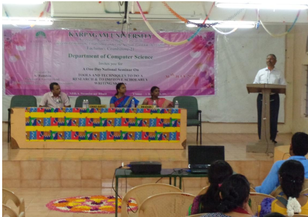
Inaugural address by the chief guest