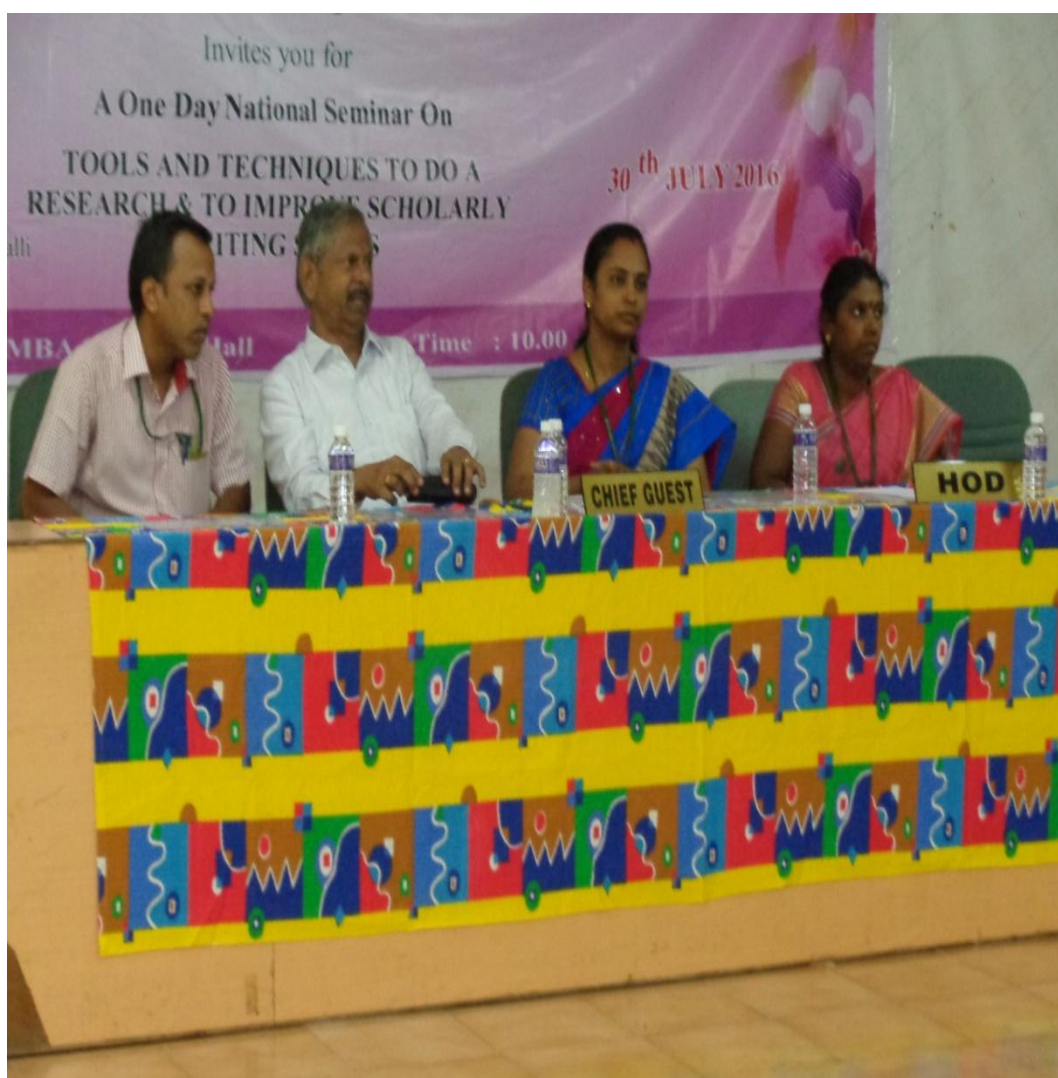
National Seminar on “Tools & Techniques to do a Research & to improve Scholarly Writing Skills” - Inauguration