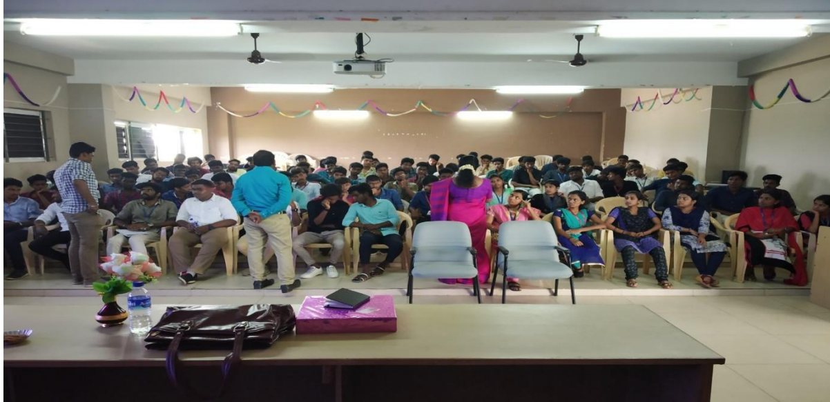
Participant interacting with chief guest

There were 29 from B.Sc. CT students and B.Sc. IT students got benefited from this Soft Skills Development workshop.