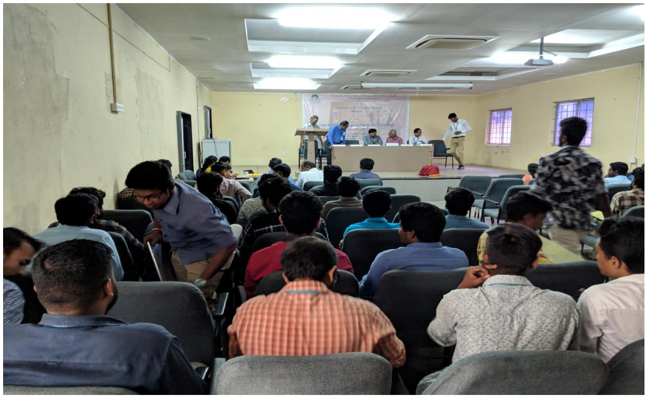
Inaugural Session of event