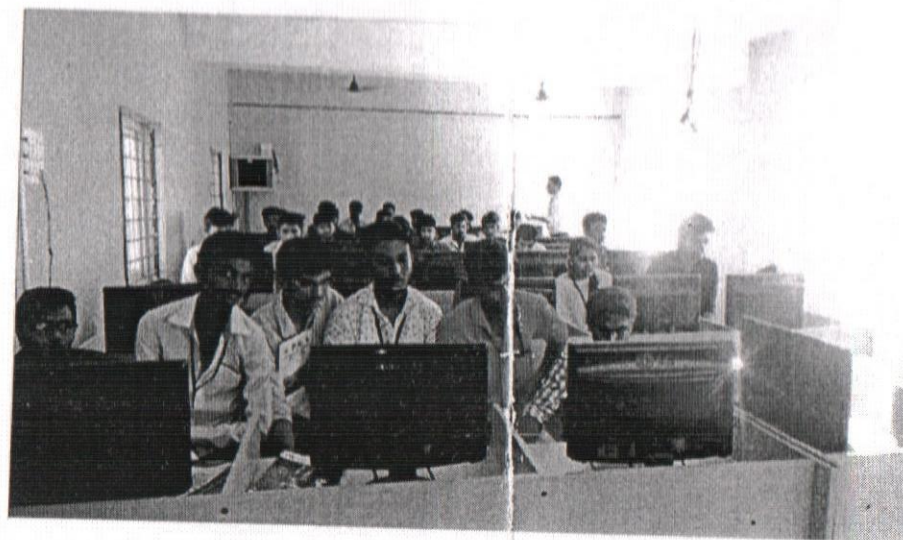
TWO DAY HANDS ON TRAINING PROGRAMME ON "PLC & SCADA FOR INDUSTRIAL APPLICATIONS" - 23.8.16 & 24.8.16