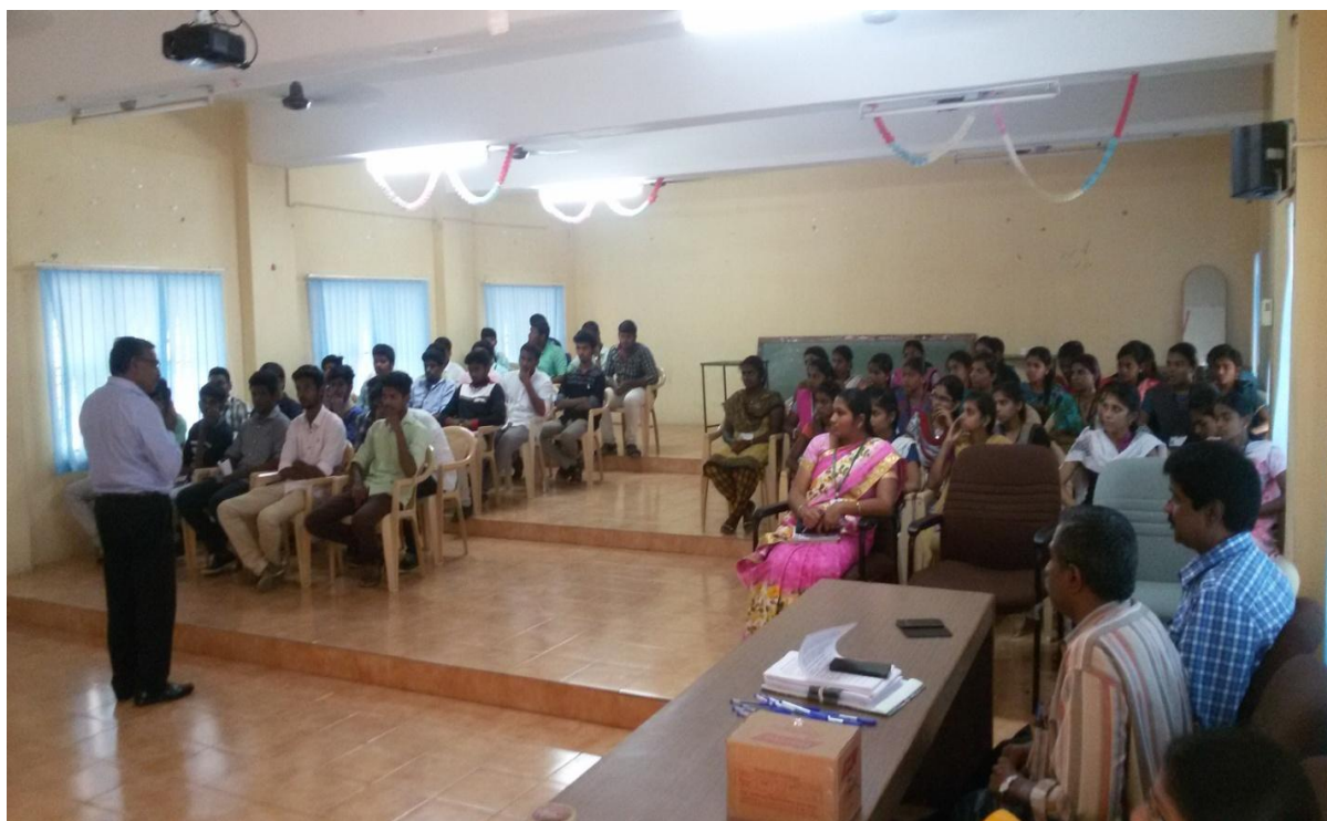
Chief guest addressing to the students

Department of Training and placement of Karpagam Academy of Higher Education has organized workshop on Verbal, Reasoning and Aptitude from 19.01.2016 to 21.01.2016 . The objective of verbal reasoning tests is to reveal the student's skills, not check student's knowledge. The most common of these is the 'true, false and cannot say' format which requires you to decide which is the most applicable based on a small passage of text.