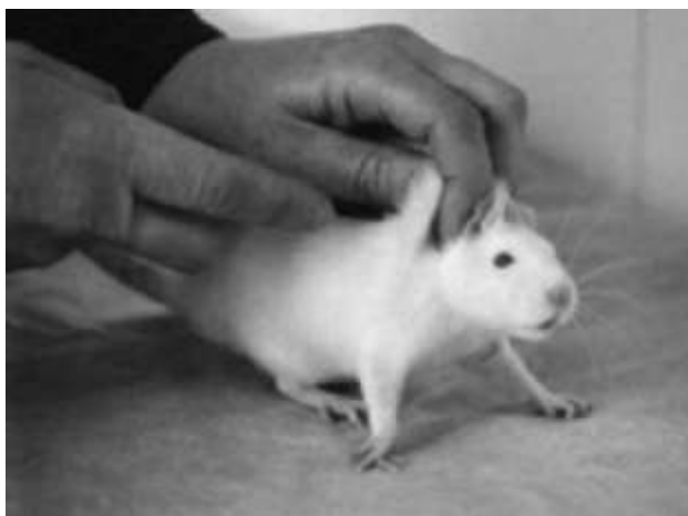
Figure 9.2 Subcutaneous injection.

For most species, subcutaneous injections can be given into the scruff of the neck (Figure 9.2). A fold of skin is lifted using the thumb and first two fingers of one hand, and the needle is passed through the skin at the base of the fold parallel to the body, to avoid penetrating deeper tissues. Subcutaneous injections are rarely painful, unless the substance being injected causes stinging.