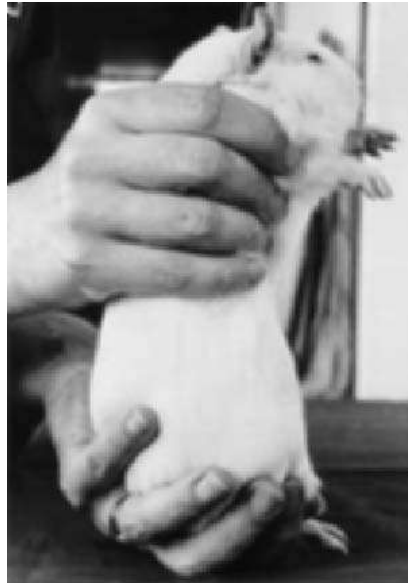
Figure: Handling the guinea pig.

Relatively few infectious diseases are seen in guinea pigs. Guinea pigs are unique among non-primates in having a dietary need for vitamin C however, and will develop signs of deficiency, if fed diets that are not designed for guinea pigs, which have been stored incorrectly, or fed after the use by date, since vitamin C is labile and will degrade over a period of time. Most infectious diseases seen in guinea pigs are bacterial, with abscesses and non-specific infections most commonly encountered. However, guinea pigs can carry LCM virus (a zoonosis) and Sendai virus, and these two antigens should be included in regular screening programmes.