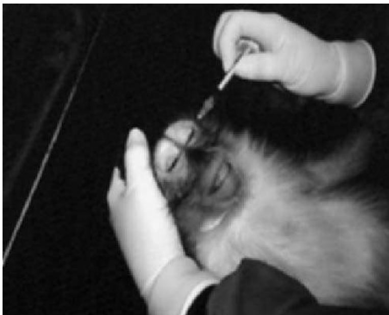
Figure 9.4 Intradermal injection used for tuberculin testing in a macaque.

In dogs and cats, injections can be given with care into the muscles on each side of the spine, and in large animals the gluteal muscles are used. In adult pigs, injections are given into the neck muscles, but a long needle is required to penetrate the fat layer. Piglets can be injected by lifting them by one hindleg and injecting into the caudal thigh muscle on that side. Fowl are given i.m. injections into the pectoral muscles. After the injection, the site should be massaged to disperse the dose.