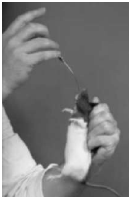
Figure 9.6 Gavage in the rat.