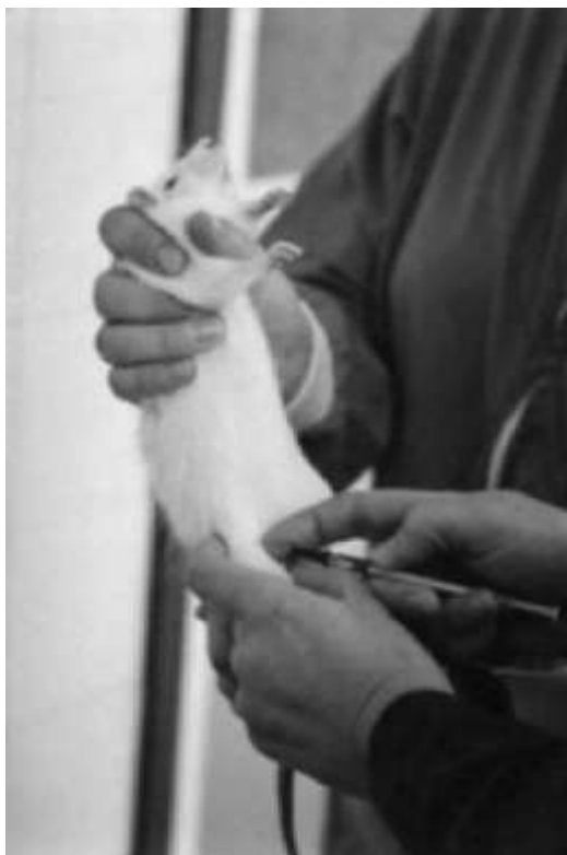
Figure 9.3 Intramuscular injection.

In rabbits, subcutaneous injections can also be given over the flank, provided that care is taken with adjuvants, because if there is an adjuvant reaction in the skin over the respiratory muscles this can cause pain on breathing. In sheep and goats fluid can be given under the skin over the ribs. For pigs, small volumes can be injected into the skin behind the ear, or into the fold between the leg and the abdomen. Pigs have much subcutaneous fat, and injections given elsewhere are likely to enter the fat, where absorption will be particularly slow due to the poor blood supply.