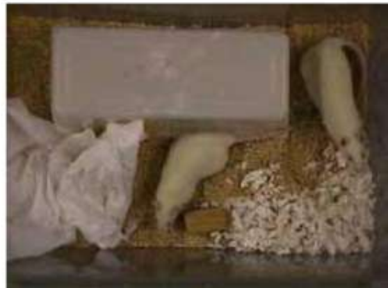
Rats make use of in-cage shelters