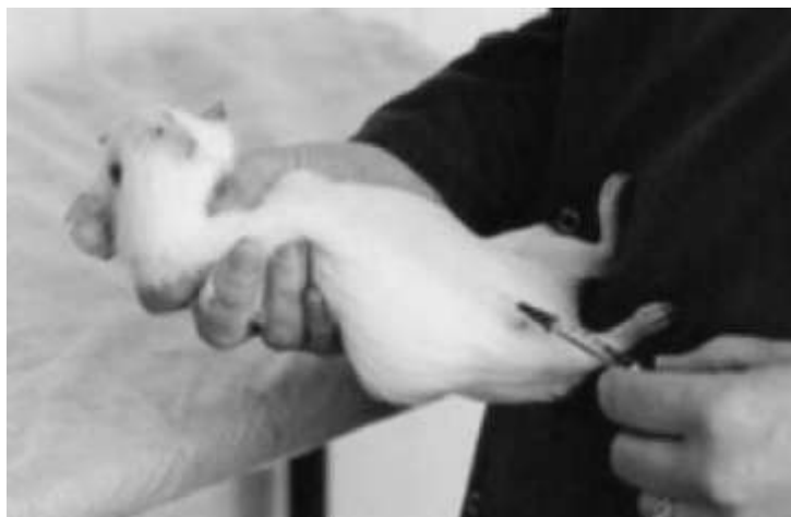
Figure 9.5 Intraperitoneal injection.