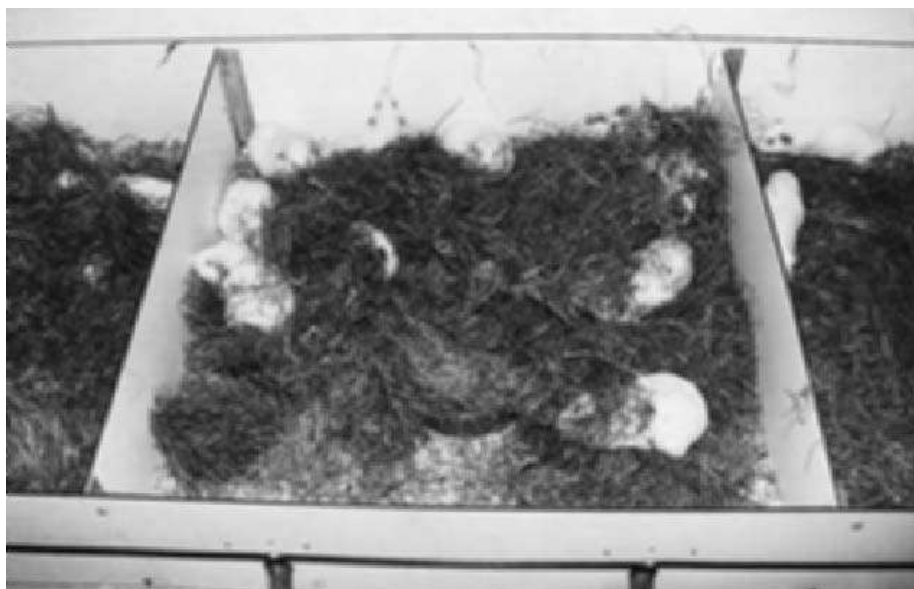
Figure: Guinea pigs housed in floor pens.

together with hay. Fine shavings and sawdust alone may cling to moist areas, such as the perineum, and probably are best not given to breeding guinea pigs. Larger shavings are better for these animals. Guinea pigs are messy animals and will disperse opaque, creamy coloured urine and faecal pellets throughout the pen. All pens, cages, feeding receptacles and water bottles must be cleaned and disinfected at least weekly. Removal of urine scale may require the use of acidic-cleaning agents.