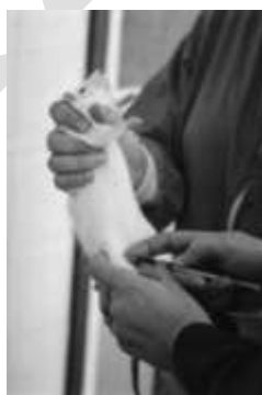
Figure 9.3 Intramuscular injection.

In rabbits, subcutaneous injections can also be given over the flank, provided that care is taken with adjuvants, because if there is an adjuvant reaction in the skin over the respiratory