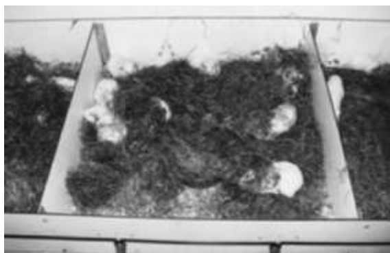
Figure: Guinea pigs housed in floor pens.

guinea pigs. Larger shavings are better for these animals. Guinea pigs are messy animals and will disperse opaque, creamy coloured urine and faecal pellets throughout the pen. All pens, cages, feeding receptacles and water bottles must be cleaned and disinfected at least weekly. Removal of urine scale may require the use of acidic-cleaning agents.