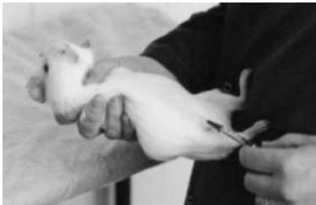
Figure 9.5 Intraperitoneal injection.

Intraperitoneal injections in rodents are given in the lower left or right quadrant of the abdomen as there are no vital organs in this area. The quadrants are demarcated by the midline and a line perpendicular to it passing through the umbilicus. The animal should be held either by an assistant or in one hand on its back, upright, so that it is comfortable and securely supported. The needle is angled at 45° to the skin and no resistance should be encountered to the passage of the needle (Figure 9.5).