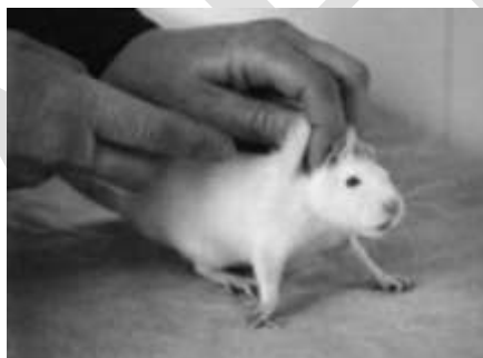
Figure 9.2 Subcutaneous injection.

For most species, subcutaneous injections can be given into the scruff of the neck (Figure 9.2). A fold of skin is lifted using the thumb and first two fingers of one hand, and the needle is passed through the skin at the base of the fold parallel to the body, to avoid penetrating deeper tissues. Subcutaneous injections are rarely painful, unless the substance being injected causes stinging.