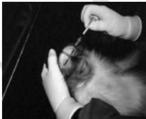
Figure 9.4 Intradermal injection used for tuberculin testing in a macaque.

Intramuscular injections are frequently painful, due to the distension of muscle fibres, which occurs, and therefore, good restraint is required. They are usually given into the muscles of the thigh. Larger volumes or irritant compounds should be injected into the quadriceps group on the front of the thigh. The muscle can be immobilised with one hand while injecting with the other. Injections can be given into the caudal thigh muscles, but as the sciatic nerve runs through these muscles, irritant compounds should not be given here or damage may be caused to the nerve. In rodents, the quadriceps feels like a small peanut on the front of the thigh, and can be immobilised with the thumb and forefinger of one hand while injecting with the other (Figure 9.3).