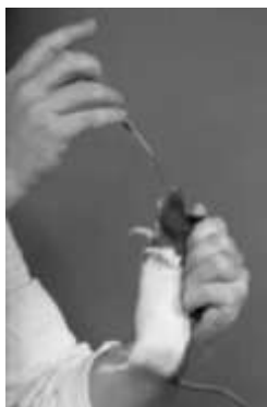
Figure 9.6 Gavage in the rat.