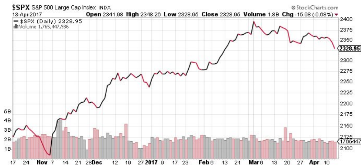
Figure 11 – Line Chart Example