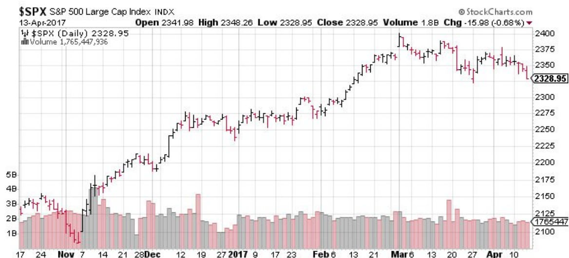
Figure 12 – Bar Chart Example