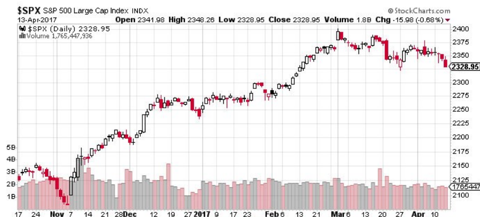
Figure 13 – Candlestick Chart Example

There are four primary types of charts used by investors and traders depending on the type of information they're seeking and their desired goals. These chart types include line charts, bar charts, candlestick charts, and point and figure charts. In the following sections, we will focus on the S&P 500 over the same period to illustrate the differences between the charts when the underlying data set is the same.