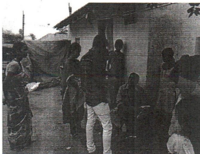
Pamphlet Distribution to People