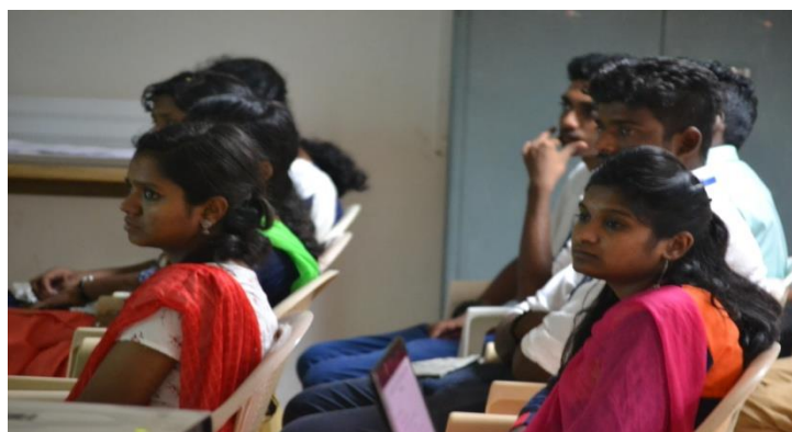
Students of second year B.Tech Food Technology