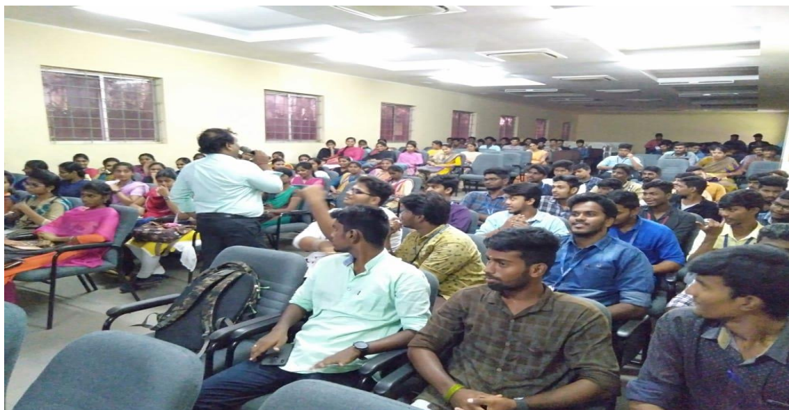
Students questioned about the ways of improving Problem solving skills