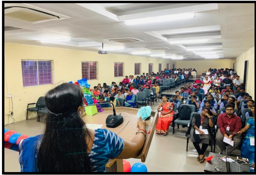
Addressing the gathering