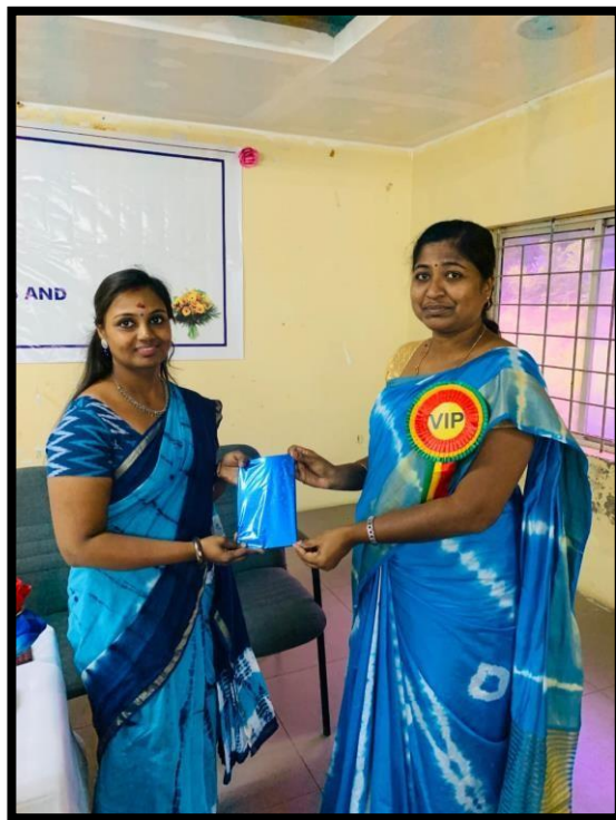
Memento was given to the guest