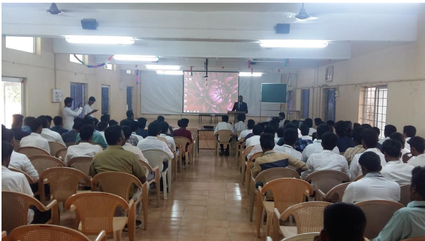
Session handled by the resource person