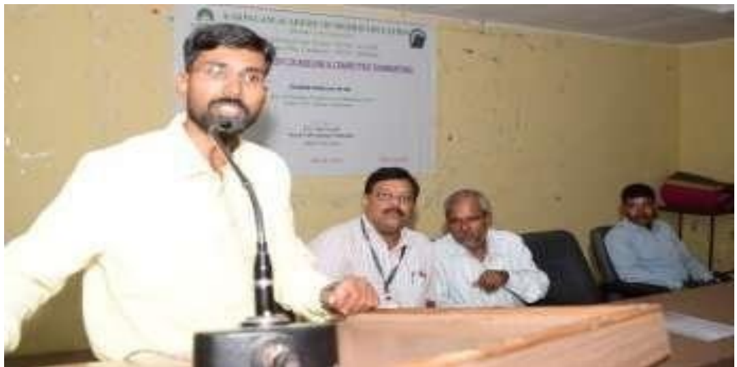
Inaugural speech by Resource person