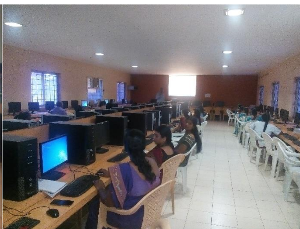
Hands on Training of the Workshop Participants on 12.06.2018