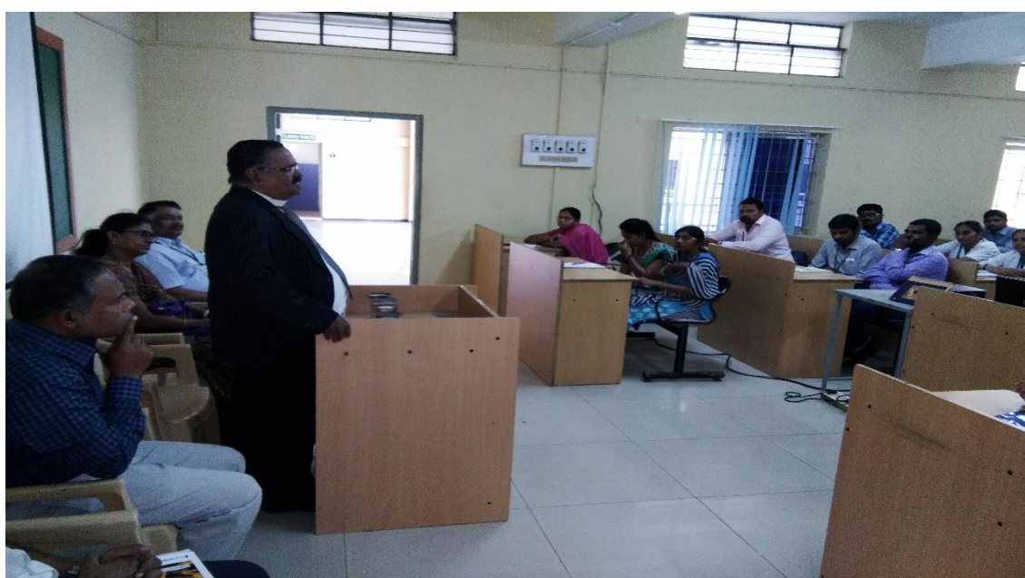
Vice Chancellor during the inaugural session on the One Day Workshop on Use of appropriate tools and techniques in Research

40 participants took part in the workshop and at last Director, HRDC thanked the gathering and the resource person for coming down for this one day workshop.