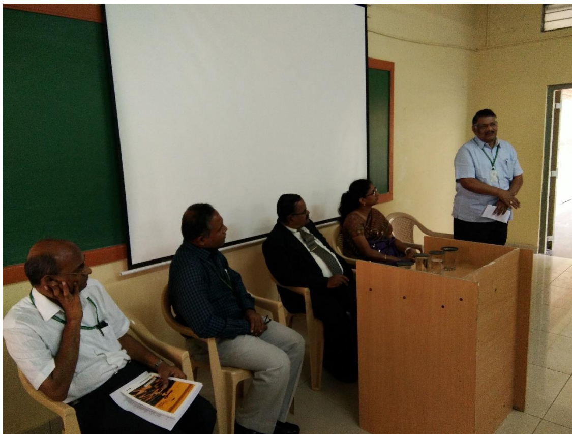
Registrar felicitating the scholars on the One Day Workshop on Use of appropriate tools and techniques in Research