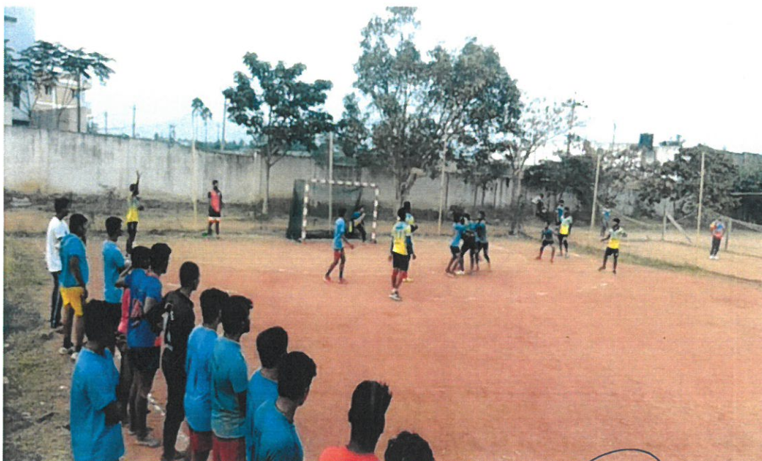
Intramural Sports and Games Handball Tournament ,09.01.2018