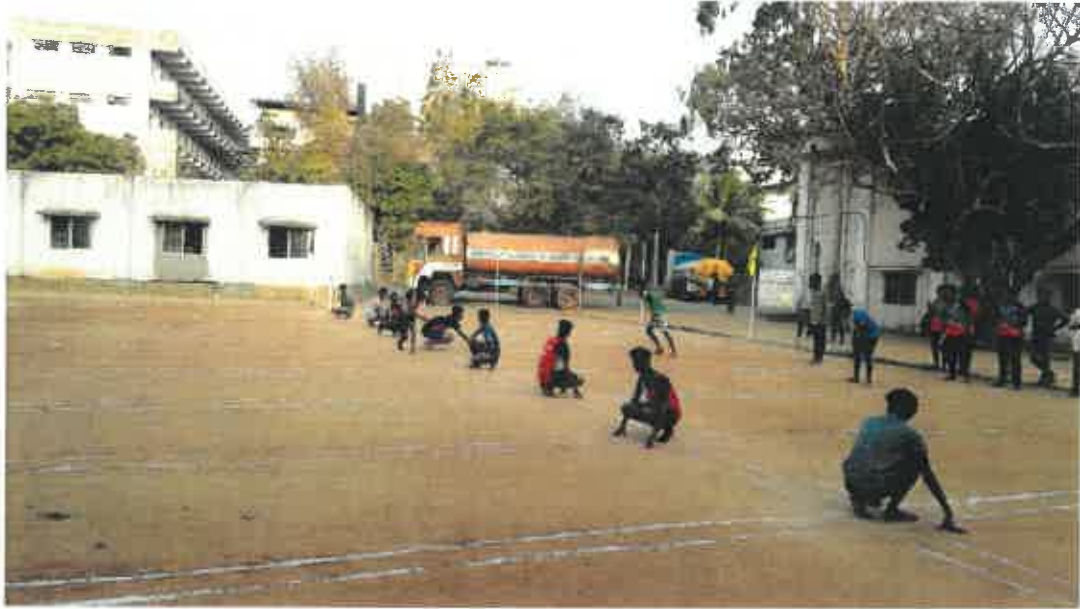
Kho-Kho Tournament ,08.01.2018