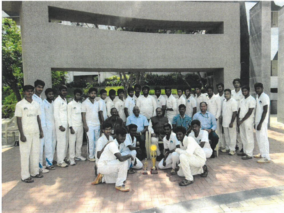
Intramural Sports and Games Cricket Tournament ( Winners and Runners) ,11.01.2018