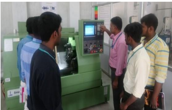
Training on CNC Turning Center – 22.10.2016