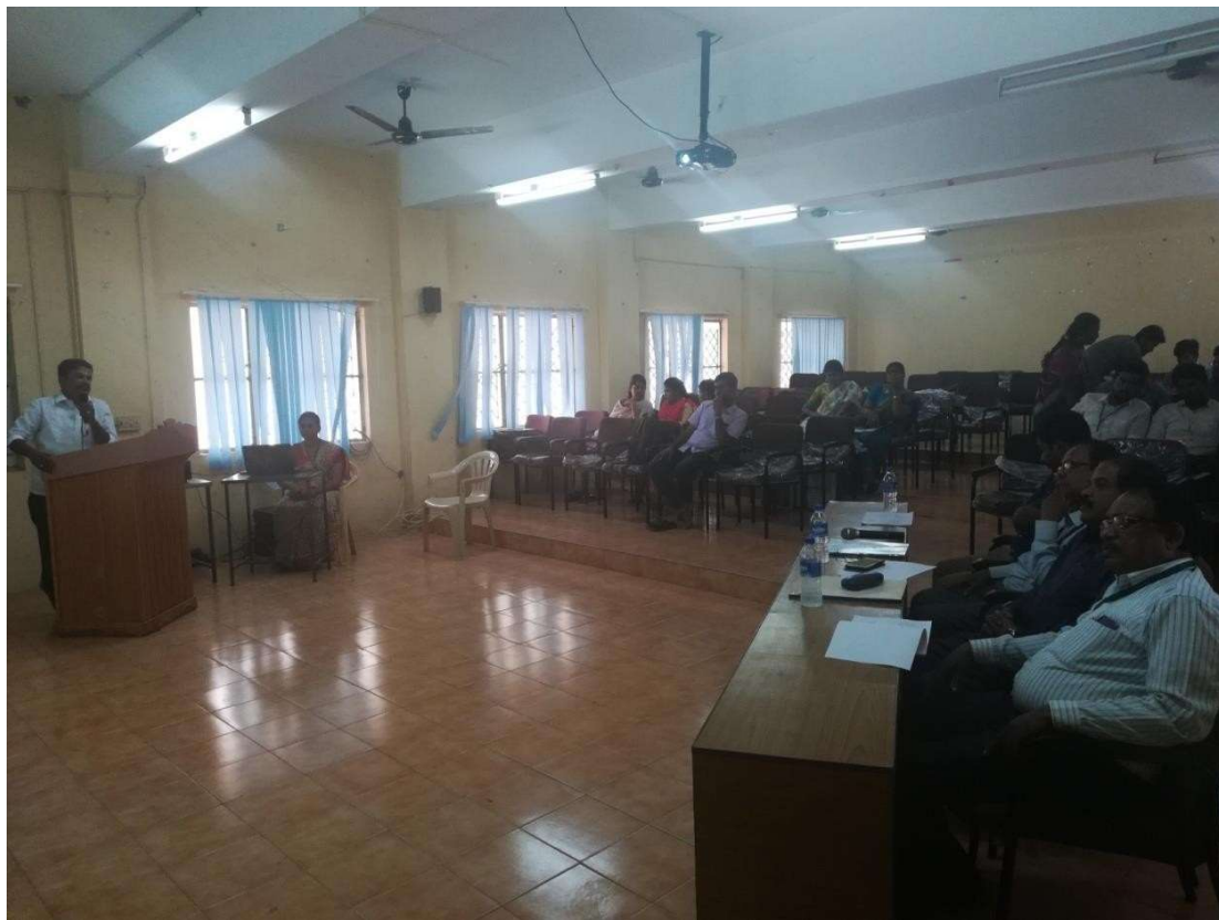
SHORT TERM COURSE on Estimation and Quantity Surveying - 24.10.2016 – 29.10.2016