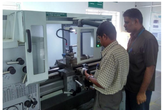
Training on All Geared High Speed Lathe – 24.10.2016